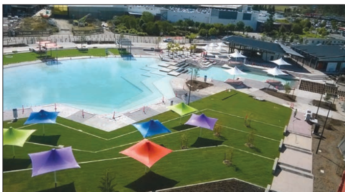
The Orion Lagoon in 2015

In 2014, after much debate and discussion, Council decided to build a Lagoon as part of Robelle Domain. The Lagoon was a first for the City of Ipswich.