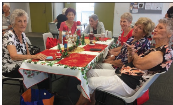
Christmas Breakup at the club.