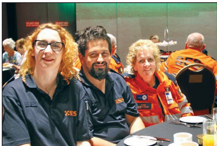
Just some of the many volunteers who were honoured recently at the International Volunteers' Day breakfast.

Volunteering Services Australia (VSA) in partnership with Ipswich City Council hosted the International Volunteers' Day breakfast in December, to recognise and reward the invaluable contribution volunteers make in Ipswich.