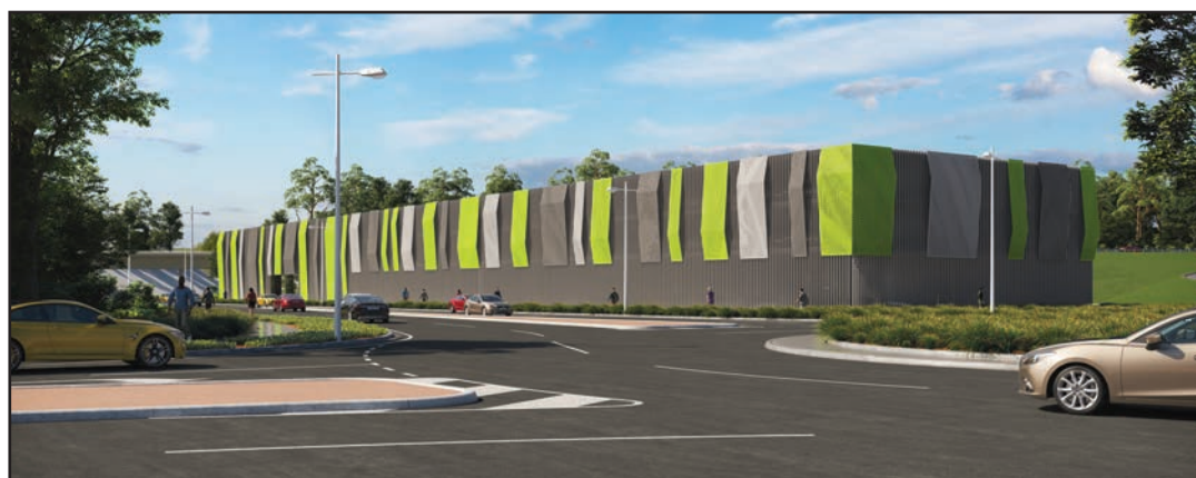
Concept image of the new park 'n' ride.

In my role, I often hear “I don’t understand why it wasn’t planned properly in the first place” – something I tend to agree with in many instances.